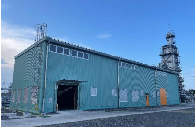
(Pre-treatment process of the plastic-to-oil conversion)

<Exterior of the chemical recycling facility>